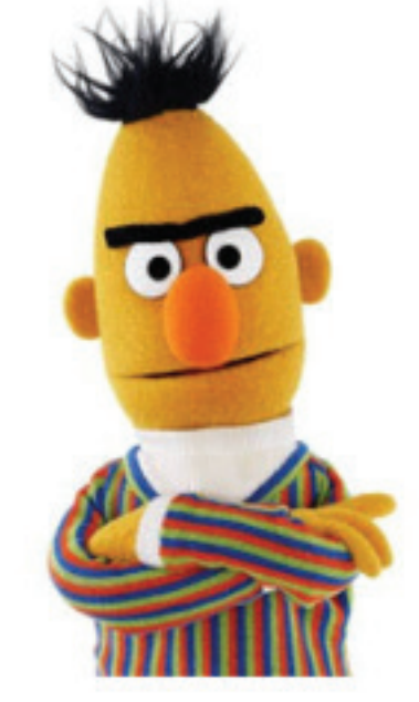
The character Bert is licensed by Sesame Street

Better understanding a user's intent leads to results that make sense to the user, leading to greater satisfaction.